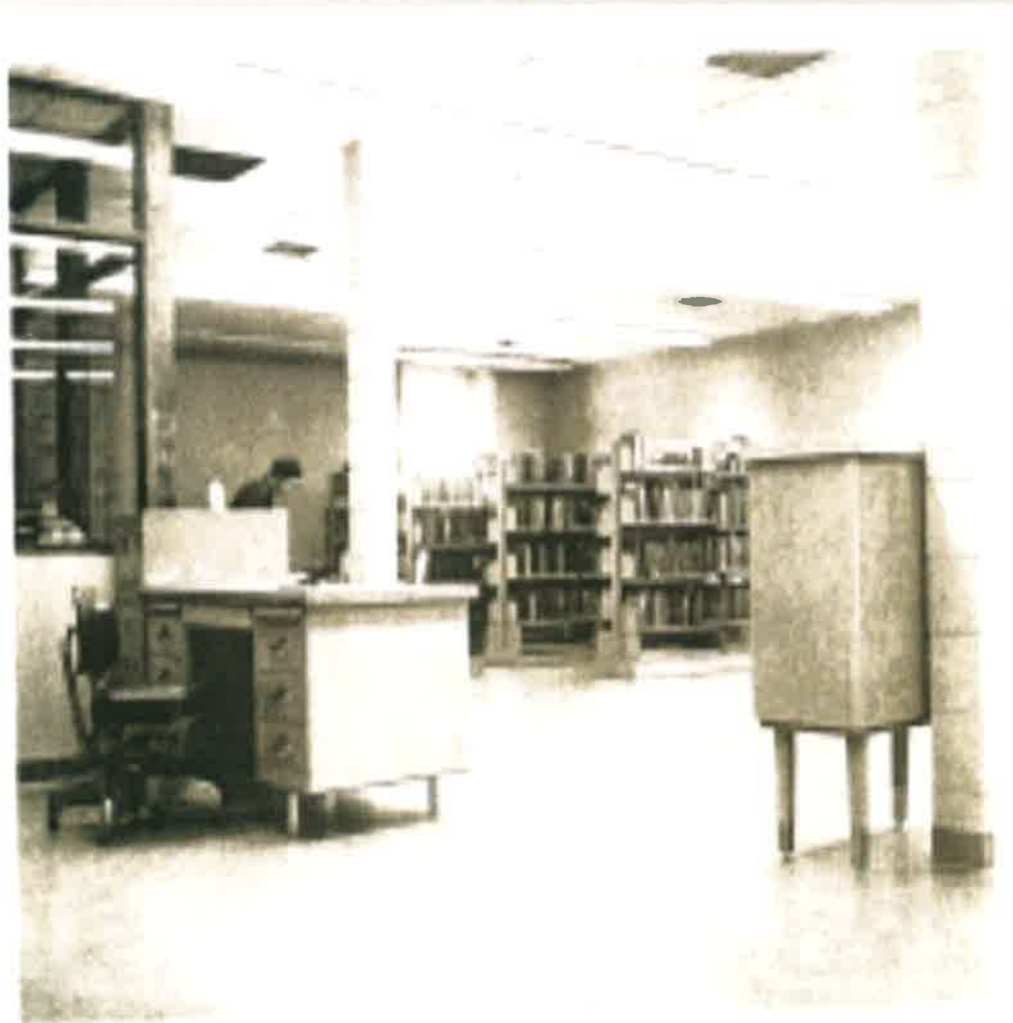
Librarian's check out desk and the children's books.

Dedication of the new building was held June 16, 1968