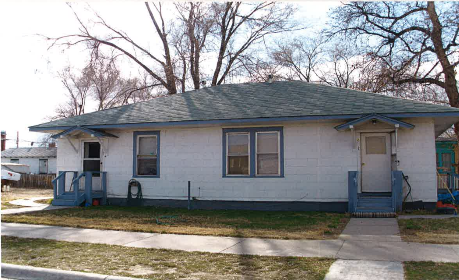
Former Library and Women's Club Building

1930 The library moved into a 2 room building, then on 1 st Ave N (formerly the Marshall Law Office) which was purchased by the Women's Club