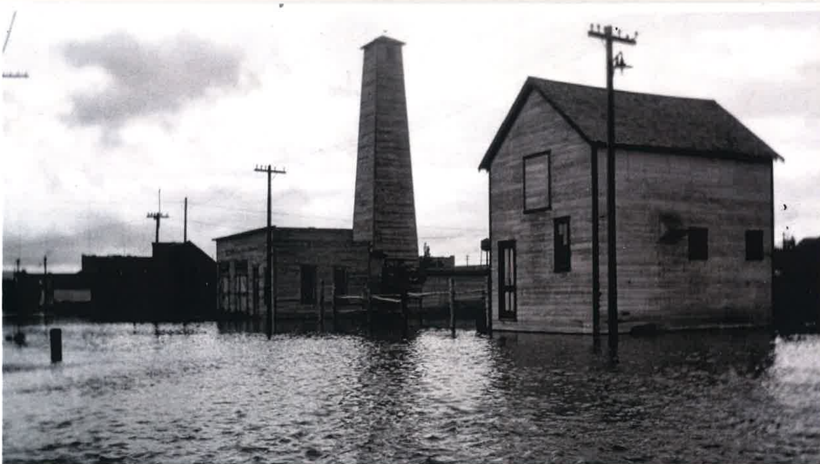
Photo from the 1929 Greybull Flood