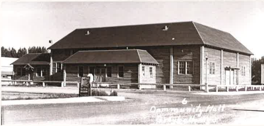
Greybull Community Hall

Library moved into the NE room of the community hall