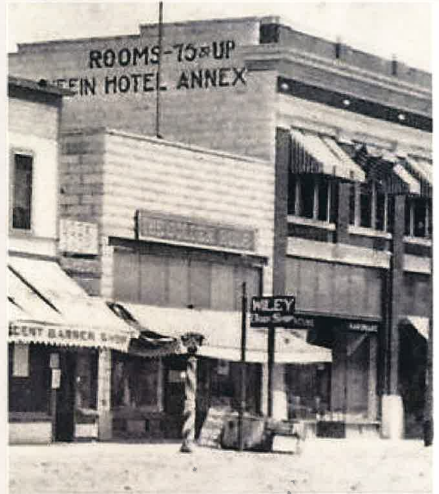
Close-up of Wiley's book store