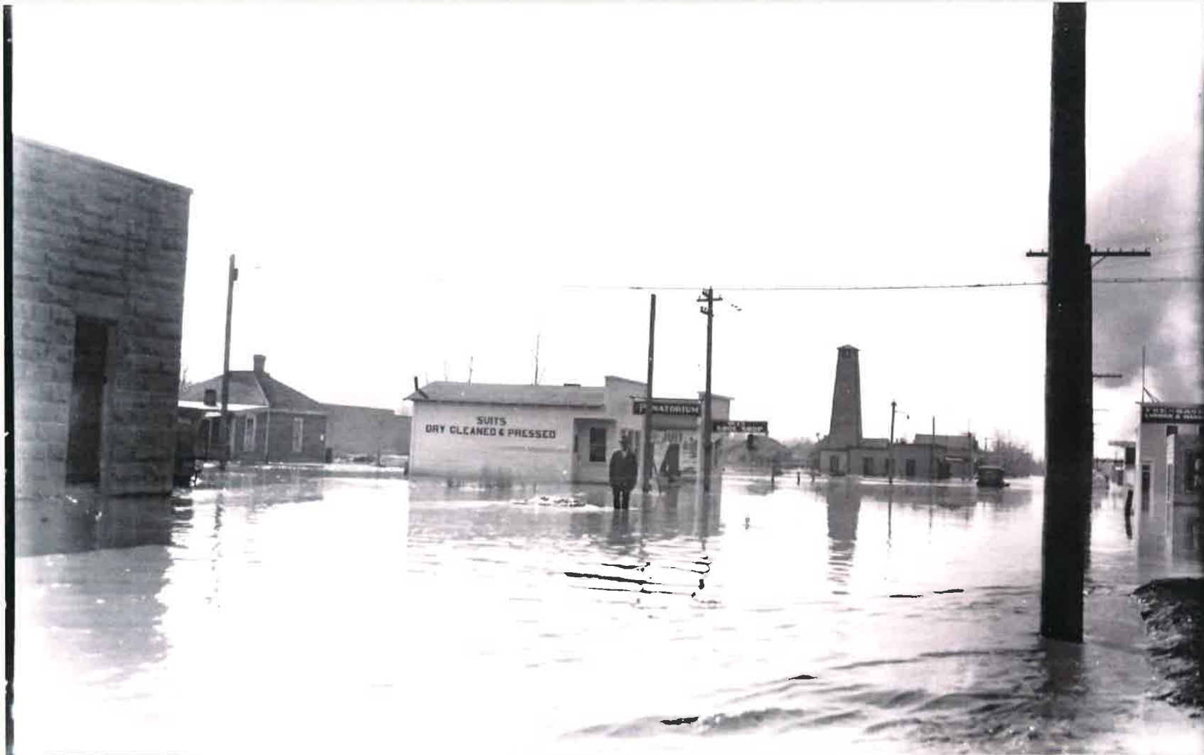
Photo taken by the east side of the bank during the 1929 flood

The library was close to the fire station seen in the distance